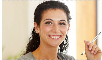
Laptop at the office