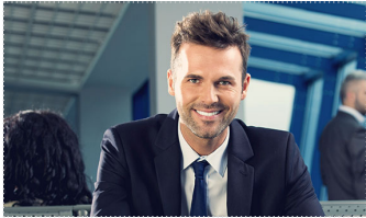
Tablet at the airport

RingCentral Meetings features high-definition video and audio. Hold meetings with up to 50 attendees from around the world with computers, smartphones, and tablets.