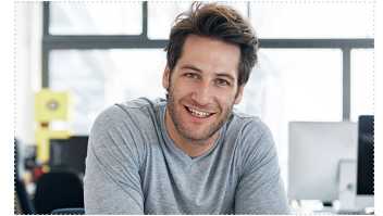
Mobile phone at home